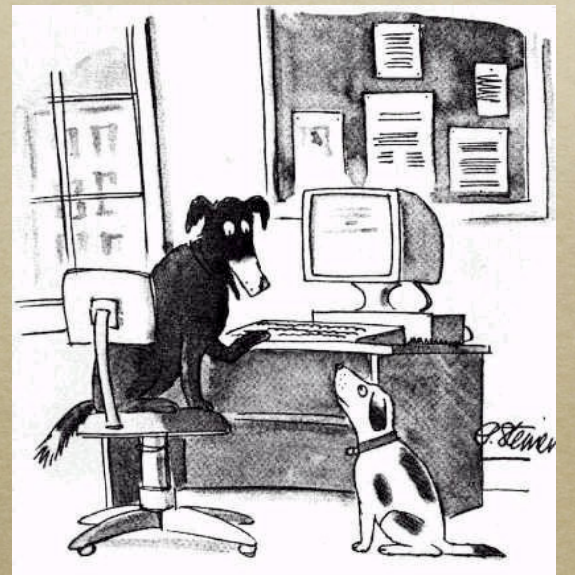
"On the Internet, nobody knows you're a dog."